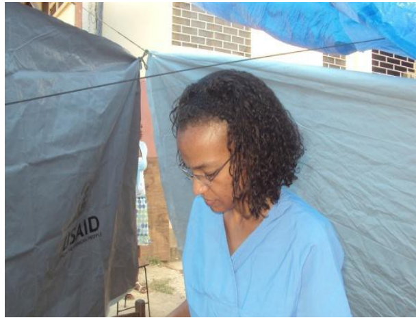
Tent clinic set up