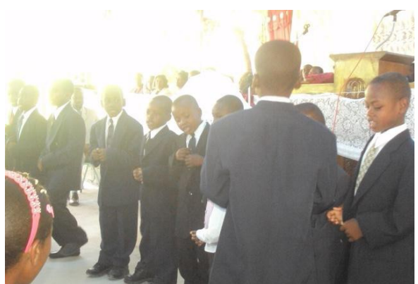
Boys from boys orphanage singing