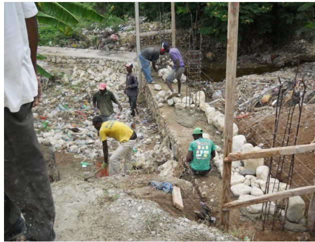
Retaining wall project