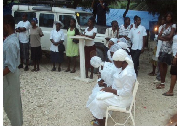
85 people were baptized