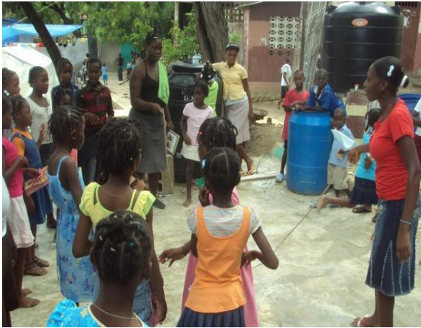
Children at Play