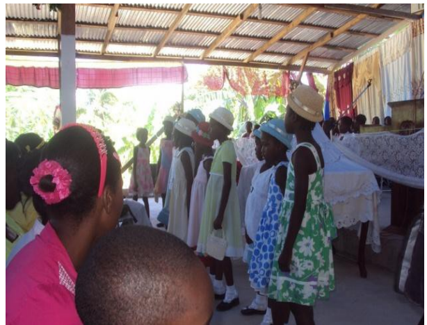
Girls from girls orphanage singing