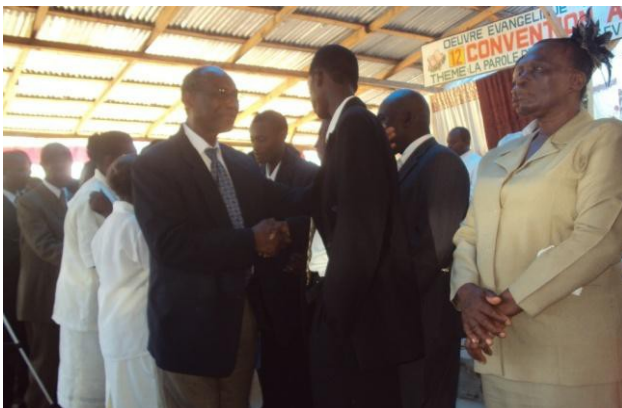
Baptized members –hand of welcome