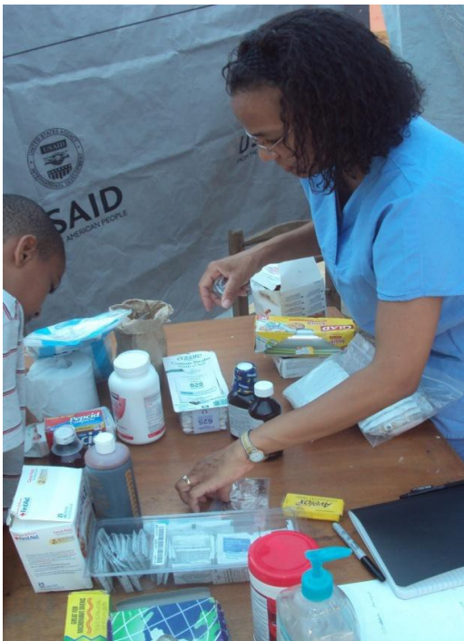
Tent clinic set up