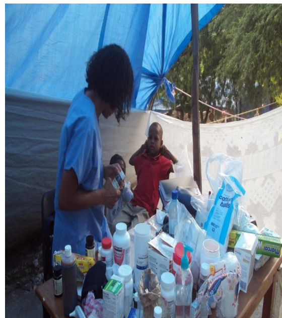
7 year boy –tested positive for malaria with high fever