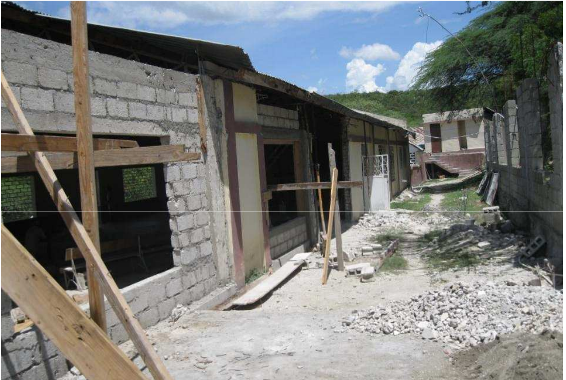
Cabarete Church Repair